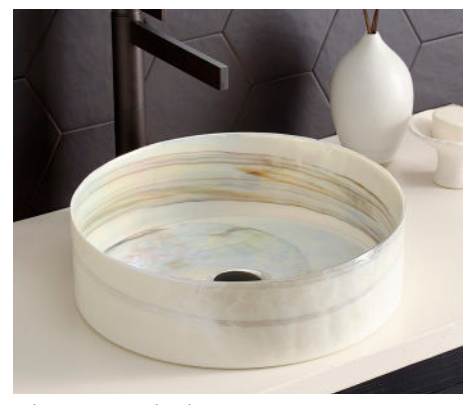
Shown in Abalone

MG1616-AE Abalone MG1616-AS Abyss MG1616-BO Bianco