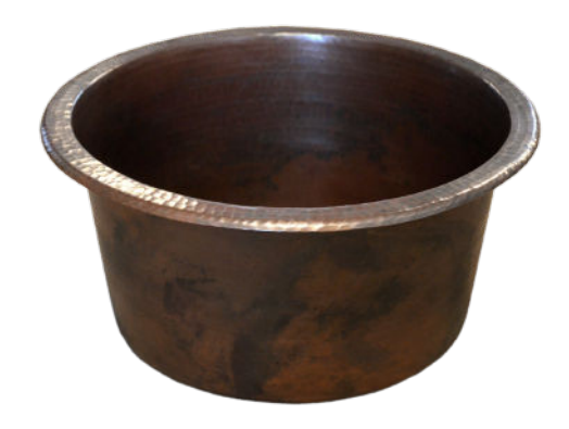
CPS235 Antique CPS435 Polished Copper CPS535 Brushed Nickel CPS835 Polished Nickel