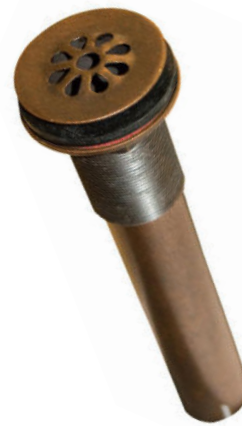
Shown in Weathered Copper

DR150-BN Brushed Nickel DR150-CB Champagne Bronze PVD DR150-CH Polished Chrome DR150-GM Gunmetal DR150-MB Matte Black DR150-ORB Oil Rubbed Bronze DR150-PN Polished Nickel PVD DR150-WC Weathered Copper