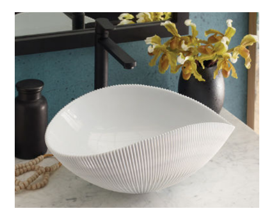
Shown in Bianco

MG1912-AE Abalone MG1912-BO Bianco MG1912-SE Shoreline