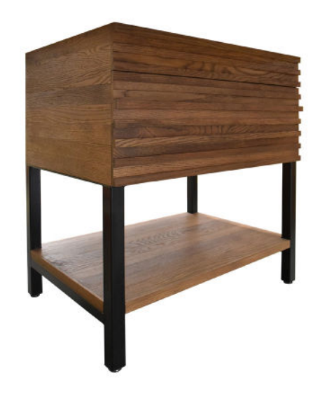
VNM301 - Cask Oak (shown) VNM308 - Charred Oak