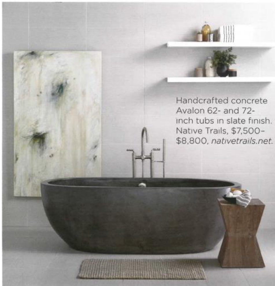
Handcrafted concrete Avalon 62- and 72- inch tubs in slate finish. Native Trails, $7,500- $8,800, nativetrails.net .

For millennia artisans have crafted furniture and objects the old-fashioned way: by hand. What this requires is skill, a connection to materials, and a desire to make something unique. What it doesn't require is a big facility full of machinery, tons of industrial waste to dispose of, and an attitude of "good enough" when one's design vision must be compromised because production capabilities focus on quantity rather than quality.