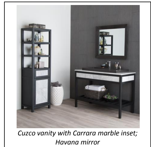
Cuzco vanity with Carrara marble inset; Havana mirror

The Cuzco Collection includes vanities, a linen tower, and complementary mirrors. Vanities and Linen Tower are made of forged iron, with insets in multiple finishes, including hammered copper, brushed nickel, and new for 2015, Carrara marble. On trend with today's larger master baths, Cuzco vanities come in widths up to 72", becoming a beautiful focal point in the home. Both the 60" and 72" vanities feature two push-to-open drawers. The linen tower features a push-to-open drawer and cabinet, providing ample bathroom storage, while three open shelves provide display space.