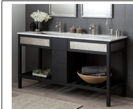
60" Cuzco Vanity Brushed Nickel inset