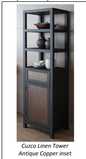
Cuzco Linen Tower Antique Copper inset