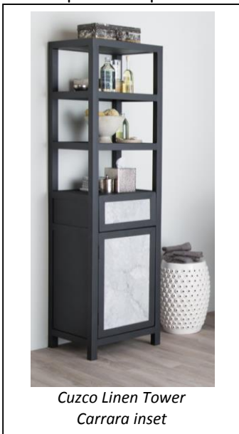
Cuzco Linen Tower Carrara inset