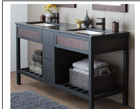
60" Cuzco Vanity Antique inset