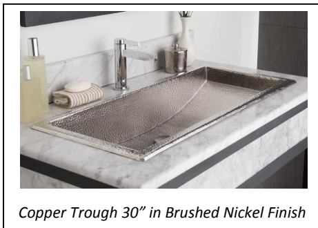
Copper Trough 30" in Brushed Nickel Finish