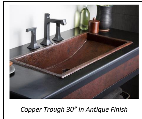
Copper Trough 30" in Antique Finish